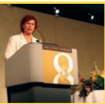
Minister Oswald bringing greetings at the Canadian Healthcare Safety Symposium

To promote and facilitate the adoption of patient safety knowledge and procedures , on May 22, 2008, the Institute launched " Patient Safety is in YOUR Hand " with the Manitoba Pharmaceutical Association and the Winnipeg Regional Health Authority. The initiative promotes clear communication of medication prescriptions. It promotes the elimination of the use of ambiguous medical notations in all documentation as they can seriously harm patients or cause death if they are misread or misinterpreted. The initiative is also endorsed by the College of Registered Nurses of Manitoba, the College of Registered Psychiatric Nurses of Manitoba and the Institute for Safe Medication Practices Canada. Sponsors include the Regional Health Authorities of Manitoba and the Healthcare Insurance Reciprocal of Canada (HIROC).