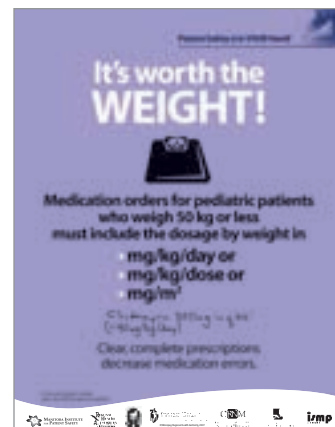
"Patient Safety is in YOUR Hand!" posters