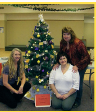
"Patient Safety Tree" designed by the Selkirk Patient Advocacy in the Community Group for Selkirk Tree Festival

We distributed about 45,000 medication cards, 1,000 patient advocate forms, 5,000 It's Safe To Ask English brochures, 1,000 brochures and 1,150 posters on disclosure of critical incidents, hundreds of pocket-size lists of Do Not Use Abbreviations, and numerous medication safety DVDs.