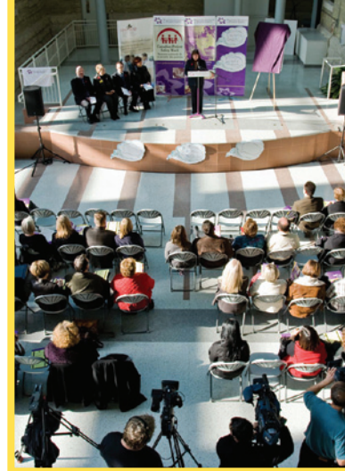
Canadian Patient Safety Week 2009

Information for healthcare providers is in development.